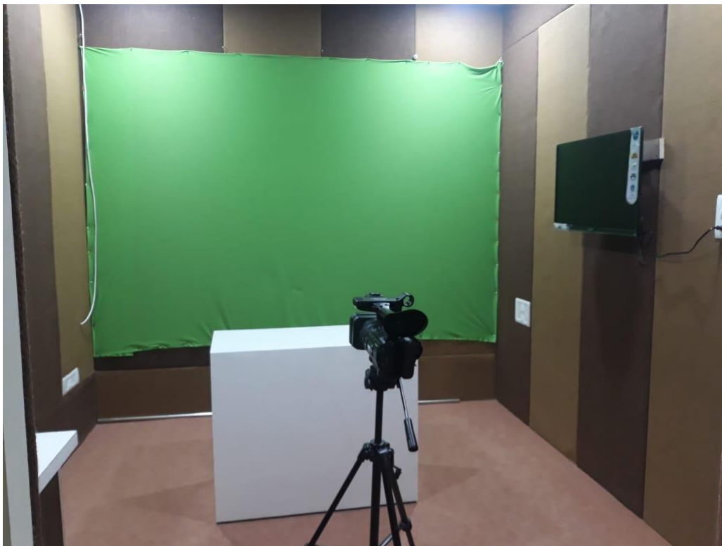
VIDEO RECORDING ROOM