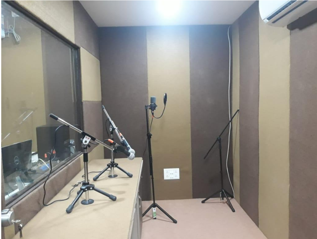
AUDIO RECORDING ROOM