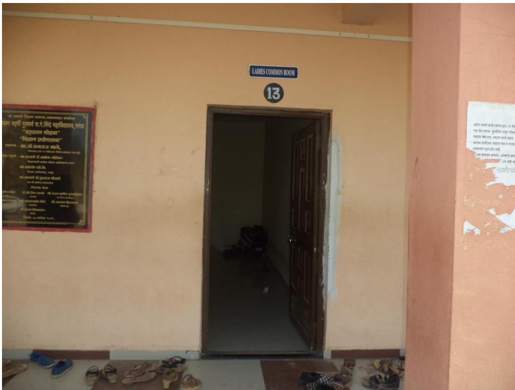
LADIES COMMON ROOM